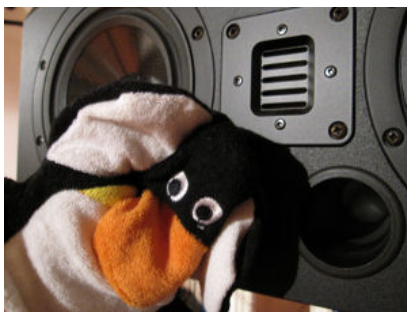
Figure 1: Ping.

All figures should be centered on the column (or page, if the figure spans both columns). Figure captions (in italic ) should follow each figure and have the format given in Figure 1. Vectorial figures are preferred (e.g., Postscript, PDF, etc.). Also, in order to provide a better readability, figure text font size should be at least identical to footnote font size. If bitmap figures are used, please make sure that the resolution is enough for print quality. Figure 2 illustrates an example of a figure spanning two columns.